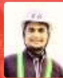
BUDHA HG INFRA